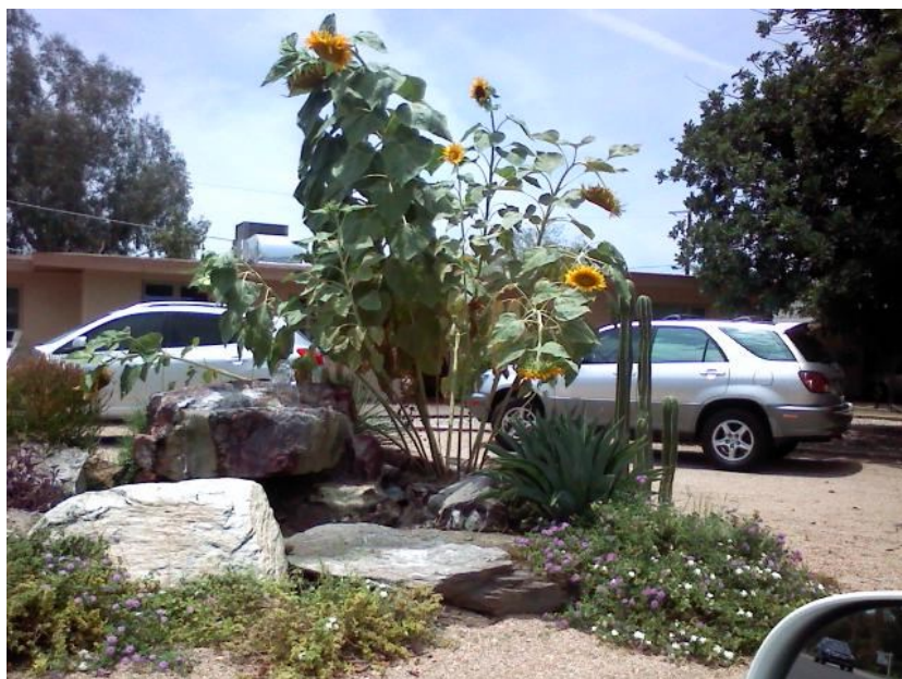
Large sunflowers adorn this fountain making a fantastic summertime sight.